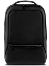
DELL PREMIER SLIM BACKPACK 15 | PE1520PS

Compact and portable 7-in-1 USB-C mobile adapter provides superb video, data connectivity and up to 90W power pass-through to your PC.